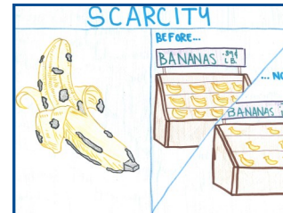
Program funded by Econ Illinois.

Stimulate interest in the fundamentals of our economic system, and give your students an opportunity to creatively demonstrate their understanding of the economy! Students create a poster that illustrates one of several economic or personal finance concepts aligned with Common Core & Illinois Learning Standards for Social Science. Up to twenty-four Chicago Regional Award Winners will each receive a prize and recognition at our Spring Awards Reception, and also are entered into the state-level competition.